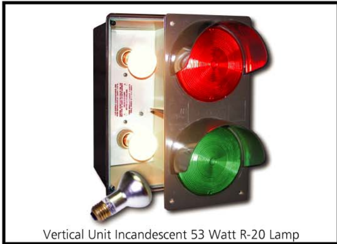
Vertical Unit Incandescent 53 Watt R-20 Lamp