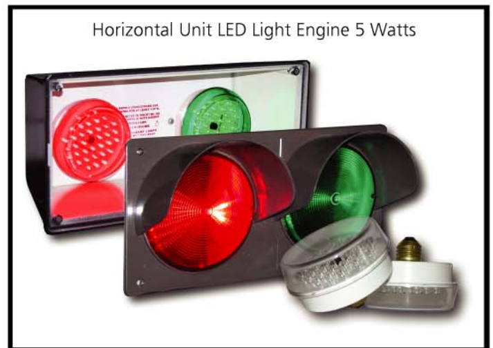
Horizontal Unit LED Light Engine 5 Watts

Typical applications include bank and fast food drive-up windows, parking garages, tollbooths, hospitals, and other indoor/outdoor areas anywhere directional control, "stop-go" or "on-off" type functions are indicated.