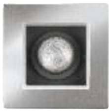
LCI36M2 Adjustable gimbal chrome trim w/white cone 4-5/8" sq. (117 mm) Housing Lamp Wattage CMH4GX GX10 20W GX10 39W