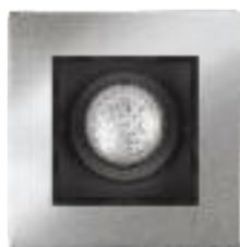
LCI34M2 Adjustable gimbal chrome trim w/black cone 4-5/8" sq. (117 mm) Housing Lamp Wattage CMH4GX GX10 20W GX10 39W