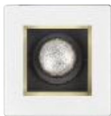
LCI33 Adjustable gimbal white trim w/ gold cone 4-5/8" sq. (117 mm) Housing Lamp Wattage CMH4GX GX10 20W GX10 39W