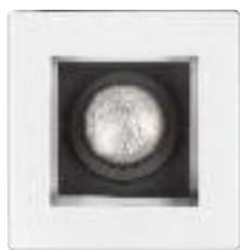
LCI32 Adjustable gimbal white trim w/ clear cone 4-5/8" sq. (117 mm) Housing Lamp Wattage CMH4GX GX10 20W GX10 39W