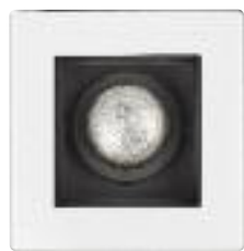
LCI31 Adjustable gimbal white trim w/black baffle 4-5/8" sq. (117 mm) Housing Lamp Wattage CMH4GX GX10 20W GX10 39W