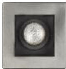
LCI34M1 Adjustable gimbal brushed nickel trim w/black cone 4-5/8" sq. (117 mm) Housing Lamp Wattage CMH4GX GX10 20W GX10 39W