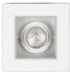
LCI31W Adjustable gimbal white trim w/white baffle 4-5/8" sq. (117 mm) Housing Lamp Wattage CMH4GX GX10 20W GX10 39W