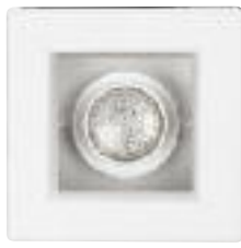
LCI36 Adjustable gimbal white trim w/white cone 4-5/8" sq. (117 mm) Housing Lamp Wattage CMH4GX GX10 20W GX10 39W