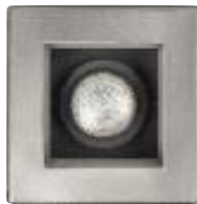
LCI37SL Adjustable gimbal brushed nickel trim w/brushed nickel cone 4-5/8" sq. (117 mm) Housing Lamp Wattage CMH4GX GX10 20W GX10 39W

Philips Capri reserves the right to make changes without notice.©2009