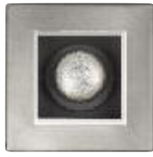
LCI36M1 Adjustable gimbal brushed nickel trim w/white cone 4-5/8" sq. (117 mm) Housing Lamp Wattage CMH4GX GX10 20W GX10 39W