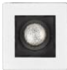
LCI34 Adjustable gimbal white trim w/ black cone 4-5/8" sq. (117 mm) Housing Lamp Wattage CMH4GX GX10 20W GX10 39W