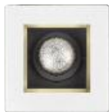
LCI33 Adjustable gimbal white trim w/ gold cone 4-5/8" sq. (117 mm) Housing Lamp Wattage CMHR4GX GX10 20W GX10 39W