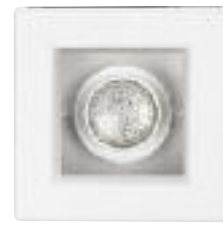
LCI36 Adjustable gimbal white trim w/white cone 4-5/8" sq. (117 mm) Housing Lamp Wattage CMHR4GX GX10 20W GX10 39W