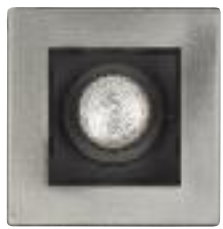
LCI34M1 Adjustable gimbal brushed nickel trim w/black cone 4-5/8" sq. (117 mm) Housing Lamp Wattage CMHR4GX GX10 20W GX10 39W