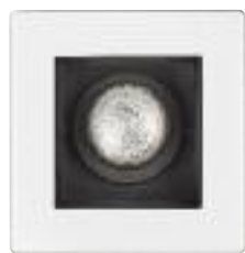
LCI31 Adjustable gimbal white trim w/black baffle 4-5/8" sq. (117 mm) Housing Lamp Wattage CMHR4GX GX10 20W GX10 39W