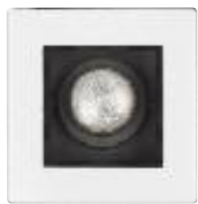
LCI34 Adjustable gimbal white trim w/ black cone 4-5/8" sq. (117 mm) Housing Lamp Wattage CMHR4GX GX10 20W GX10 39W