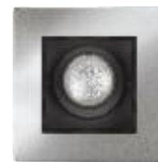
LCI34M2 Adjustable gimbal chrome trim w/black cone 4-5/8" sq. (117 mm) Housing Lamp Wattage CMHR4GX GX10 20W GX10 39W