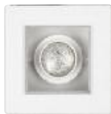
LCI31W Adjustable gimbal white trim w/white baffle 4-5/8" sq. (117 mm) Housing Lamp Wattage CMHR4GX GX10 20W GX10 39W