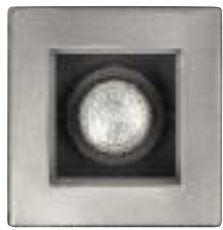
LCI37SL Adjustable gimbal brushed nickel trim w/brushed nickel cone 4-5/8" sq. (117 mm) Housing Lamp Wattage CMHR4GX GX10 20W GX10 39W

Philips Capri reserves the right to make changes without notice.©2009