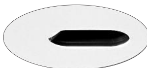
LC119 Recessed Adjustable 30° Tilt 4-1/2" O.D. (114 mm)