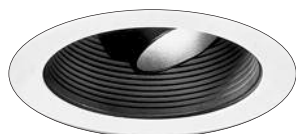
LC141 (shown) Adjustable Gimbal Ring, Black Baffle LC141W Adjustable Gimbal Ring, White Baffle