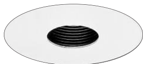
LC101 1-3/4" Pinhole, Black Baffle 4-1/2" O.D. (114 mm)