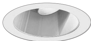
LC142 (shown) Adjustable Gimbal Ring, Clear Reflector LC143 Adjustable Gimbal Ring, Gold Reflector LC144 Adjustable Gimbal Ring, Black Reflector LC146 Adjustable Gimbal Ring, White Reflector LC147SL Adjustable Gimbal Ring, Brushed Nickel Self Flange