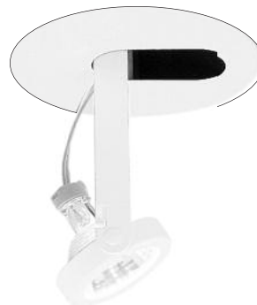
LC190 Drop Adjustable, Gimbal Ring Length 4 1/2" Lamp positioned at 4-1/2" below ceiling