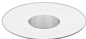
LC103 (shown) 1-3/4" Pinhole, Gold Reflector LC102 Clear Reflector LC104 Black Reflector 4-1/2" O.D. (114 mm)