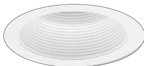
LC121W (shown) Open Trim, White Baffle LC121 Open Trim, Black Baffle 4-1/2" O.D. (114 mm)