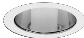
LC122 (shown) Open Trim, Clear Reflector LC123 Gold Reflector LC124 Black Reflector LC126 White Reflector LC127SL Brushed Nickel Self Flanged* 4-1/2" O.D. (114 mm)